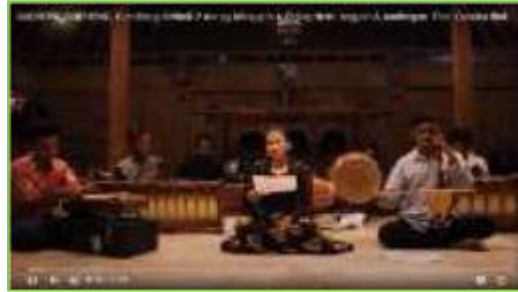
Picture 1. Demonstration of sindhenan material online via youtube.